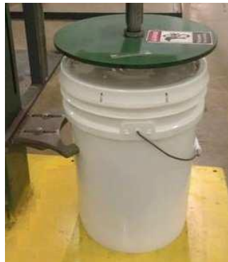
Figure A: Pneumatic Press