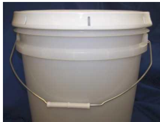
Properly seated M2 lid: