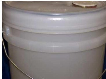
Properly seated M4 lid: