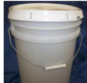
Improperly seated M2 lid: